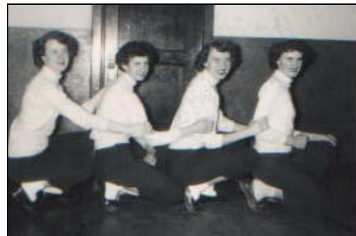
Meet the SJB Cheerleaders of 1952