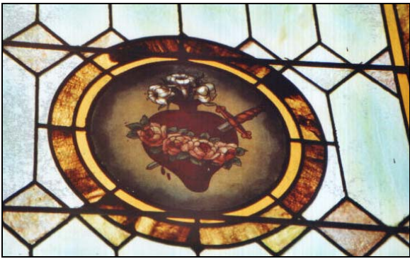
The stained glass motif in the first window on the south side near "Mary's" statue in St. John the Baptist Church.

In 1993, the search began to locate the records on the 18 huge stained glass windows in St. John the Baptist Church in Hubbardston. The study was completed in April, 2004, and the above certificate indicates that the windows are now registered with the Stained Glass Census of Michigan and their history available in the new book, Hubbardston Genealogy 1780-1930, "A Bit of History" and "A Bit of Blarney," Too.